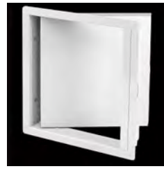
Panel Hatch Entry

Objective: Making sure the attic entrance is sealed and insulated.